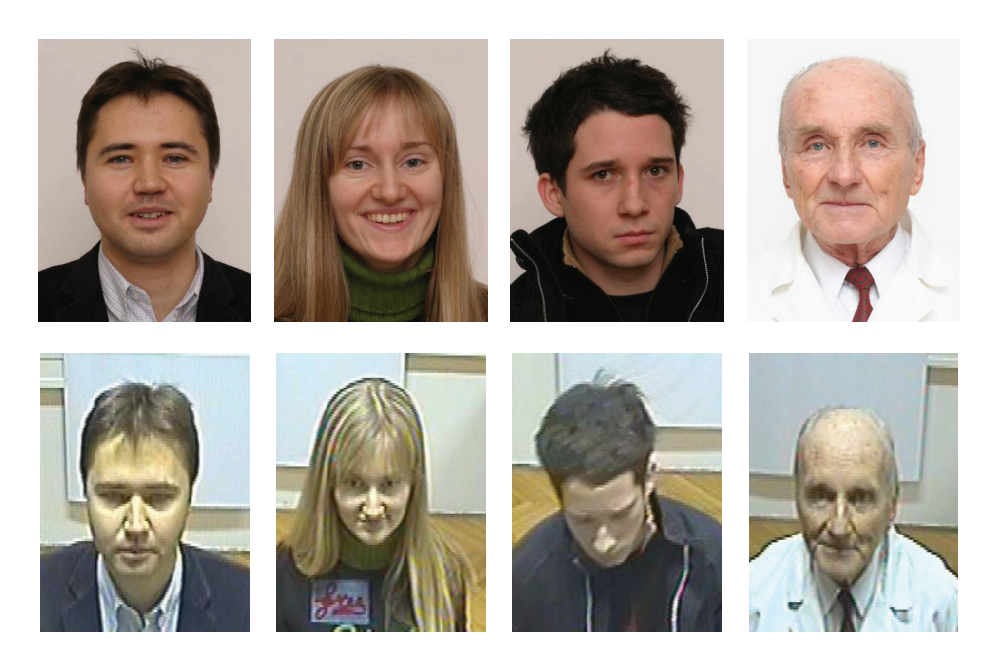
Fig. 1. A few sample gallery (first row) and probe images (second row) used in our experiments.